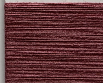
B393 * BORDEAUX