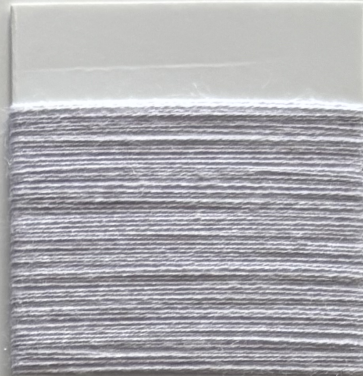
B390 * GLICINE