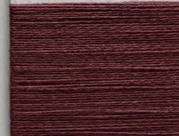
B394 * VINACCIA

* = Colori Promozionali disponibili Promotional Colours available