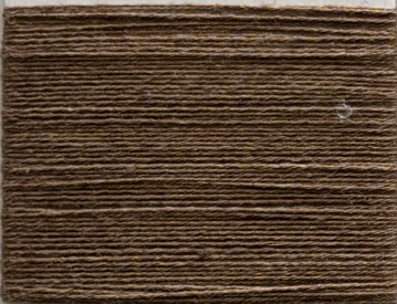
B387 * CIOCCOLATO