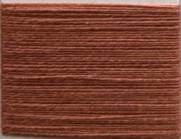
B389 * MATTONE