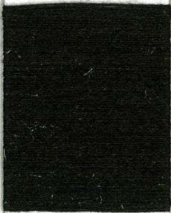
J256 * MARRONE