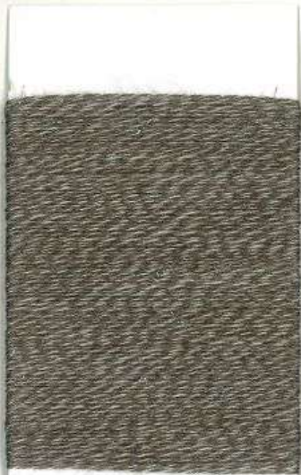
J254 * NOCCIOLA

62% Viscosa / Viscose - 17% Lana / Wool - 17% Cotone / Cotton 3% Acrilico / Acrylic - 1% Poliestere / Polyester