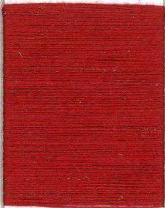
J255 * ROSSO