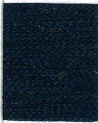
J258 * BLU