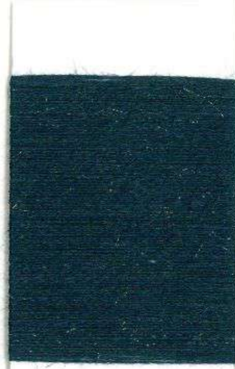
J257 * PETROLIO